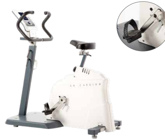
1413922 Bike Reha incl. adjustable cranks