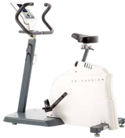
1413921 Bike Reha